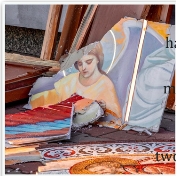
Remains after rocket Nire on Odesa in June 2022 August. This leaves us speechless and sad.

When we reviewed our contact lists of families who were enrolled in our programme in February 2022, we discovered that almost 90% no longer live in Odesa or Petrovka. All of