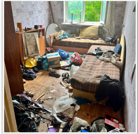
The %lat before cleaning

In May 2023, his mother passed away after having suffered for a long time. When we saw the Nlat where she had lain dead undiscovered for three days, it was clear to us that the relocation to Western Ukraine had also saved the boy's life. He has new parents and it is so good to see that he feels comfortable in his new family, that he is well cared for and accepted. We hope and pray that he, as the only survivor of his family of origin, will take a different path than his ancestors. All the groundwork for this has been laid, thanks be to God. Our association has taken care of the cleaning, disinfection and clearance of the Nlat as well as the burial of his mother.